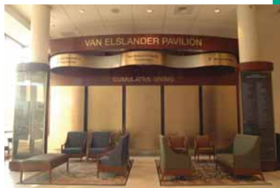
Donor recognition wall inside the Van Elslander Pavilion atrium