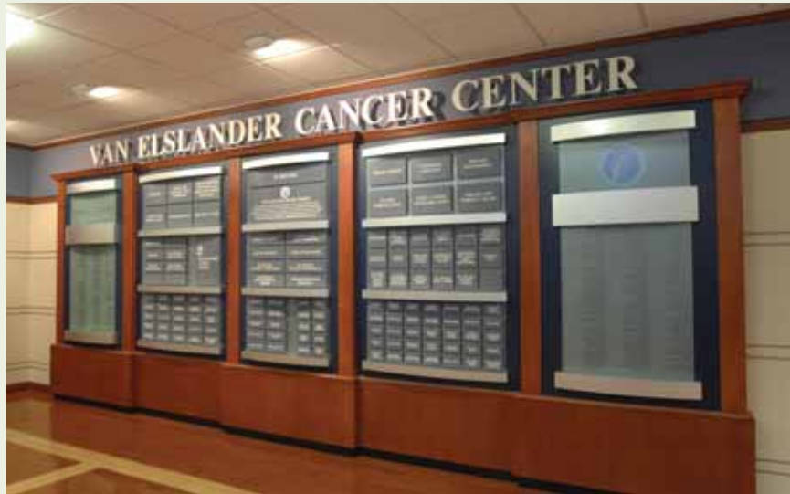
The donor recognition wall in the Van Elslander Cancer Center has been updated.