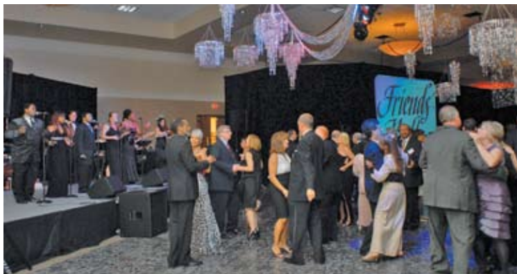
Guests dance to the sounds of the Simone Vitale Band at the 2009 Friends' Ball.

St. John North Shores Hospital Dinner Dance , March 20, 2010, Mac & Ray's, Harrison Township.