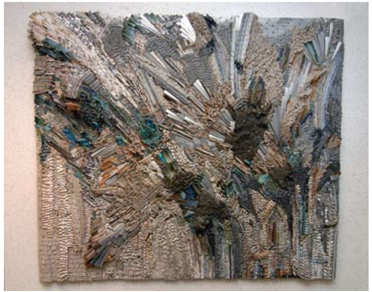
Donated artwork is on display in the VECC.