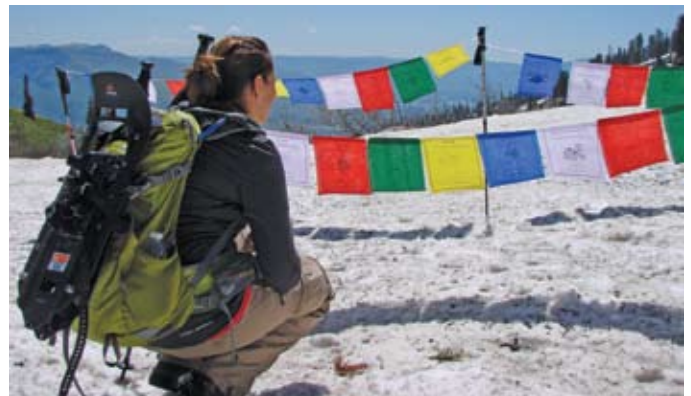
A climber spends a contemplative moment among prayer flags placed by climbers on Ben Lomond in honor or memory of loved ones.

A team of 25 climbers challenged themselves physically, mentally and emotionally by climbing Ben Lomond Peak in the Wasatch Mountains, Ogden, Utah, to raise funds for early detection of breast cancer and financial assistance for high-risk patients too young to qualify for other aid. Over $50,000 was raised in honor of the climbers who each know someone who survived breast cancer or died from the disease.