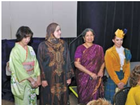
Some of the guests dressed in cultural attire.

Approximately 160 women attended this special Providence Park Hospital event celebrating women, health and cultural diversity. Women's health focus groups were formed to engage female stakeholders on how SJPHS can enhance itself as a premier provider of comprehensive, coordinated and accessible service to women and their families.