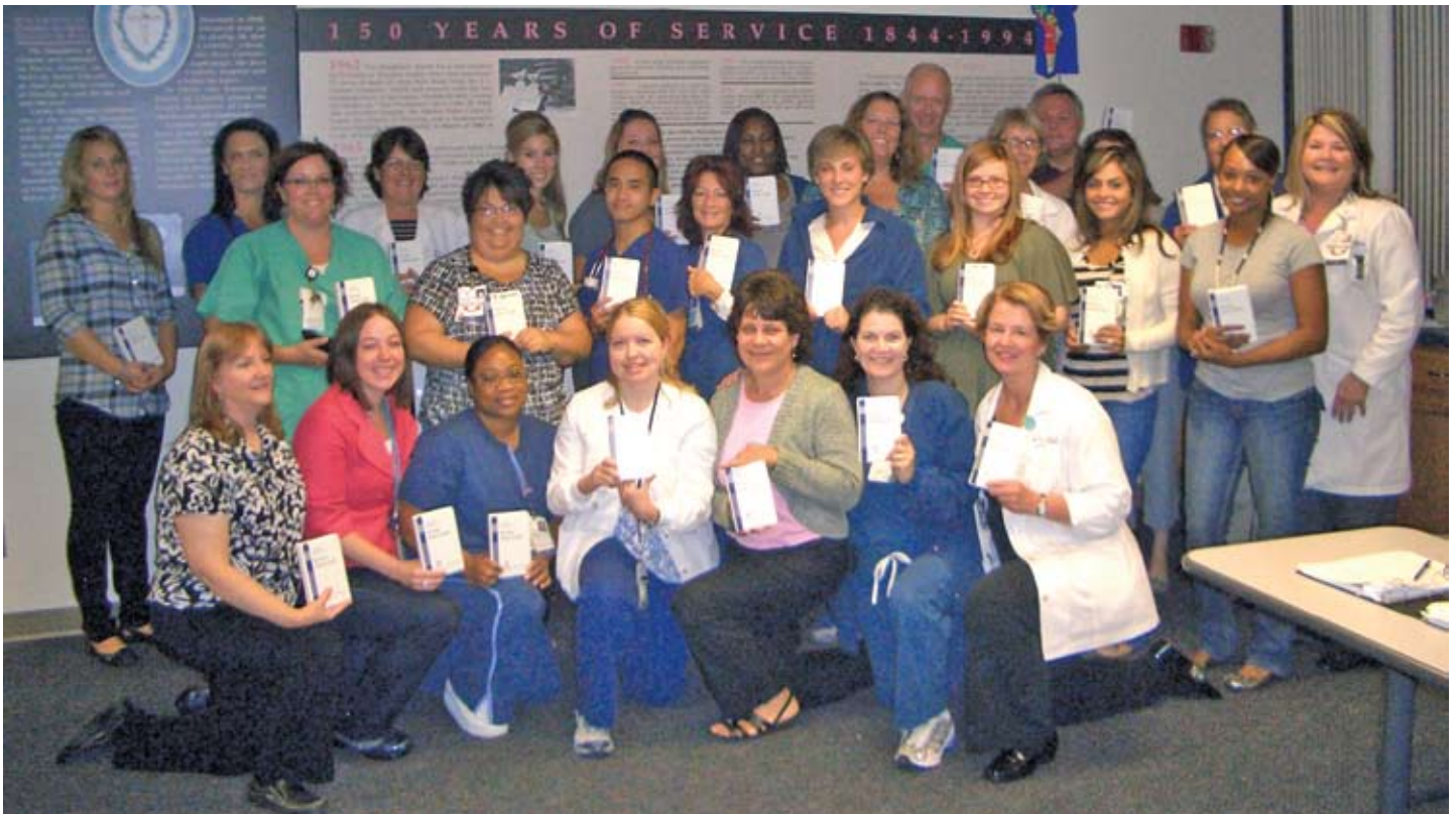
Providence nurses recently received their Nurse Pocket Guides.

In collaboration with the Professional Nurse Practice Council, the Providence Health Foundation purchased and hand-delivered 1,500 Nurse Pocket Guides to clinical nursing staff at Providence and Providence Park Hospitals. The 60-page pocket guides provide staff with key support material to reinforce their training and enhance care of patients. This project helps demonstrate the hospitals' dedication to the development of tools to help improve delivery of safe health care. The Nurse Pocket Guide was made possible by generous philanthropic support to Providence Health Foundation.