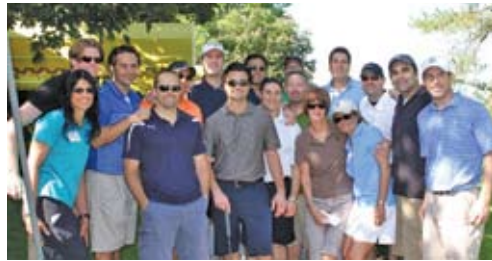
Independent Emergency Physicians had many golfers at the Providence Golf Classic.

Providence Golf Classic, June 6: Held at Indianwood Golf & Country Club, Lake Orion, the 32nd annual outing raised nearly $80,000 for the Care of the Poor Fund to assist uninsured and underinsured Emergency Center patients.