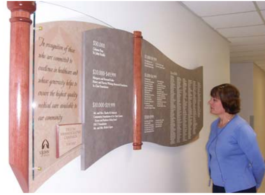
A donor recognition plaque has been established outside the radiology department to recognize those who contributed to the digital mammography campaign.

digital images on a computer screen that help physicians make the most accurate diagnoses. Some of the advantages of digital mammography include: improved contrast between dense and non-dense breast tissue; faster image time, thus less radiation exposure; shorter exam time, reducing anxiety as pictures are generated immediately; decreases number of biopsies; and fewer patients need to be called back for additional views.