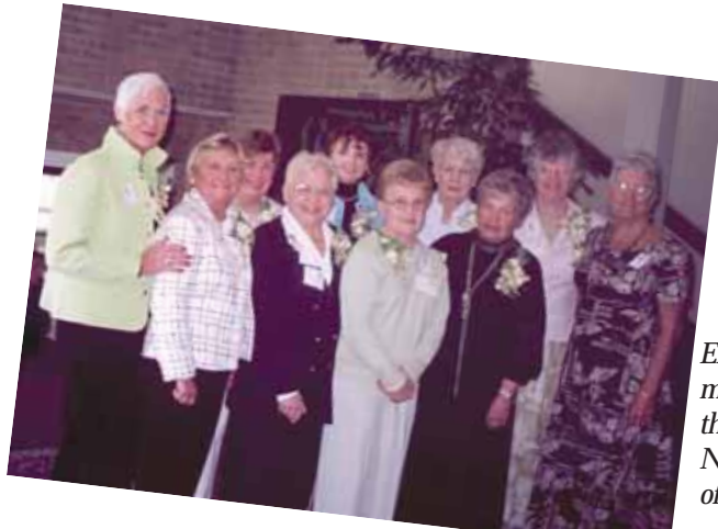
Eleven members of the Providence Nursing class of 1955.