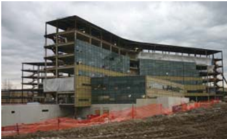
Construction continues on the new hospital.