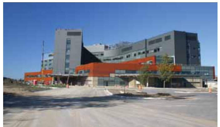
The new hospital with the walk-in entrance to the Emergency Center on the right and the ambulance entrance on the left.

Meanwhile, the Novi Orthopedic Center opened for business after the new year began, the Staybridge Suites Hotel also opened in January, and the first phase of the Medical Office Building will open in February.