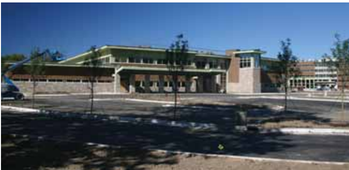
The new Orthopedic/Ambulatory Surgery Center.

Excitement is mounting on the Providence Park campus as construction on the new hospital progresses, bringing the summer 2008 opening closer to reality. The exterior of the building is complete, with a few windows left out for receiving materials. At press time, framing was in progress through the fifth floor, with dry wall work following. The Emergency Center is nearing completion; the ceiling is partially installed, flooring is under installation, and painting is done.