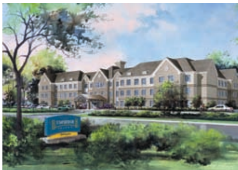
Staybridge Suites offers a convenient option for patients' families who need accommodations, for discharged patients who prefer to convalesce nearby, for temporary project teams or doctors and staff who are relocating or who just need a place to rest their heads between on-calls or in bad weather.