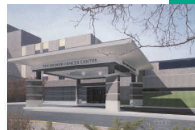
Webber Cancer Center