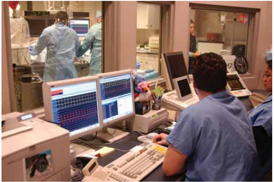
A view of one of the catheterization labs and the Cardiovascular Services staff at work.

For more information on Cardiovascular Services at SJM-OH, visit www.stjohn.org/macombheart , or call 1-866-HEART09 (1-866-432-7809).