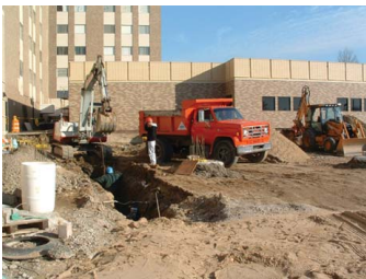
Construction to expand the Emergency Department is in progress.

Watch for more information in upcoming issues of Health Reach .