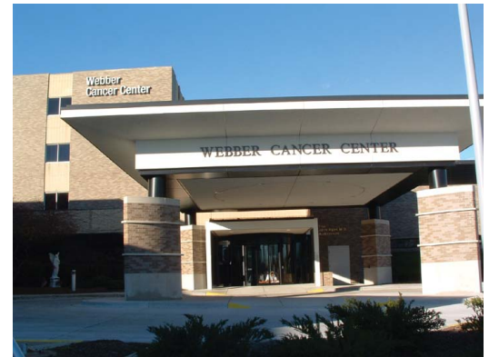
The Webber Cancer Center entrance.

Other funds for the center were raised through private donations, including a $250,000 gift from the SJMH auxiliary and associate and physician contributions.