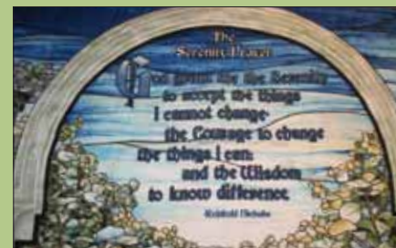
Serenity quilt hanging in the Medical Services Building was hand-stitched by volunteers.